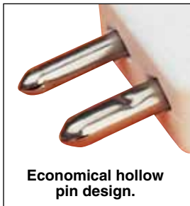
Economical hollow pin design.

We make running changes when technical advances allow. Check at time of ordering for additional features.